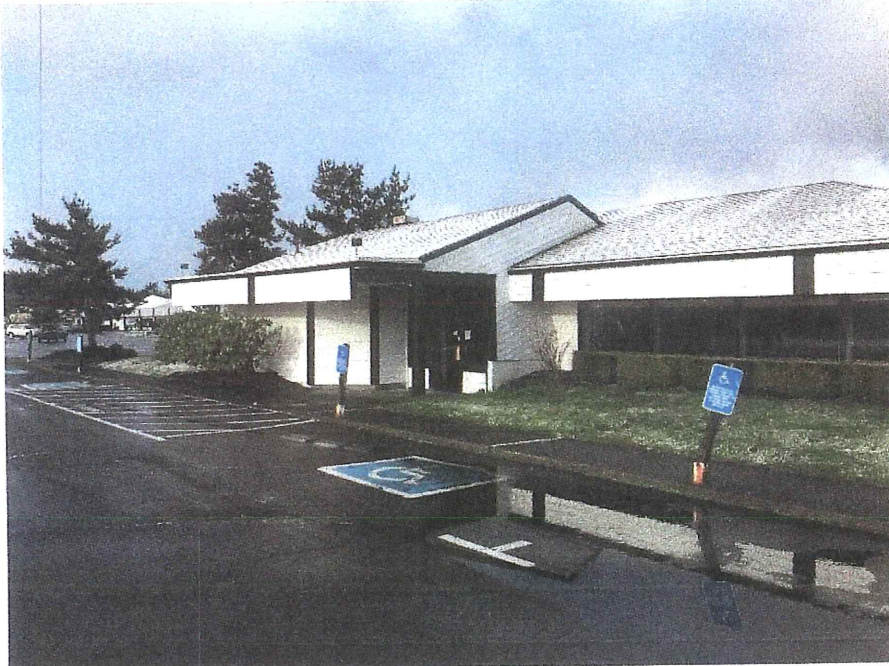
Photo One Caption LOOKING NORTHWEST - SOUTHEASTERLY CORNER BLDG. Clear Photo One